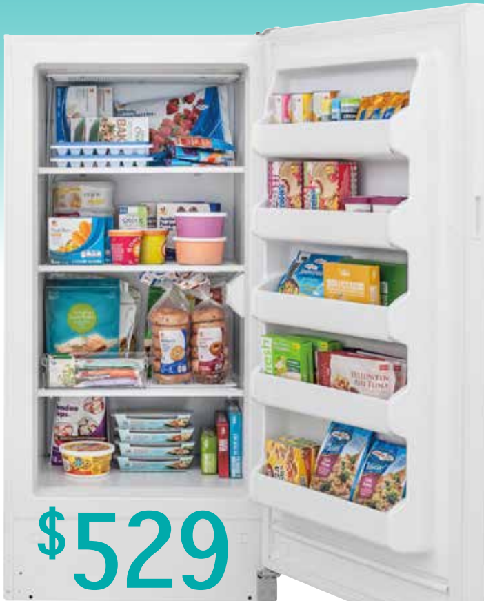
12.8 cu. ft. Upright Freezer ArcticLock™ Thicker Walls, Adjustable Temperature Control.